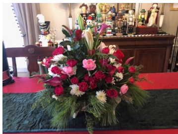
Class 1 Red Ribbon Violet Nastri