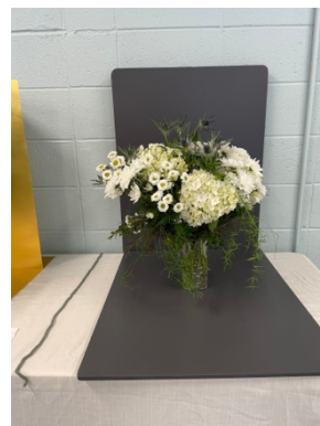
Priscilla Barnes Yellow Ribbon