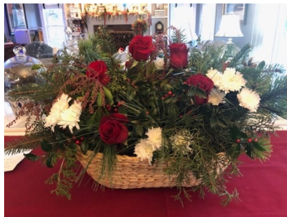
Class 2 Red Ribbon Betty Hadlock