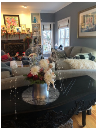
Class 2 Blue Ribbon Diana DeFilippo