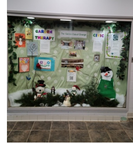
December Display Case Highlighting Garden Therapy and Civic Activities