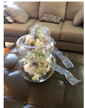
Class 2 White Ribbon Lana Ho