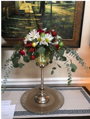
Class 1 Blue Ribbon Diane Geary