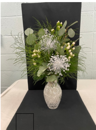
Sandy Horling Blue Ribbon