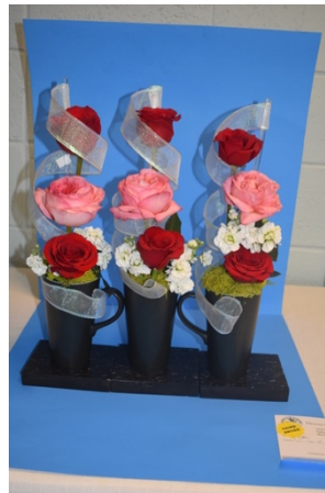
Diana DeFillippo Yellow Ribbon