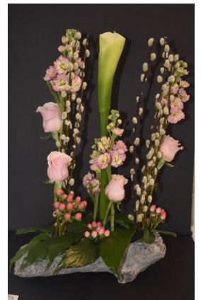
Patti Logioco White Ribbon