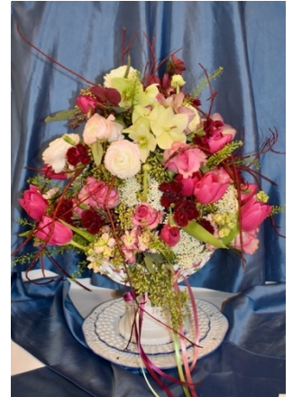
Sery Kang White Ribbon