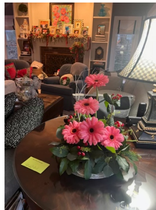
Class 2 Yellow Ribbon Lisa Stackpole