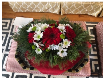
Class 1 Yellow Ribbon Pat Nizen