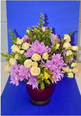
Maryellen Bspuda Blue Ribbon