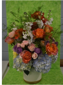
Ginny Proestakes Yellow Ribbon