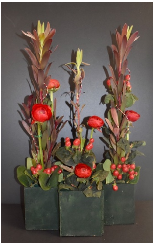
Linda Bradford Blue Ribbon